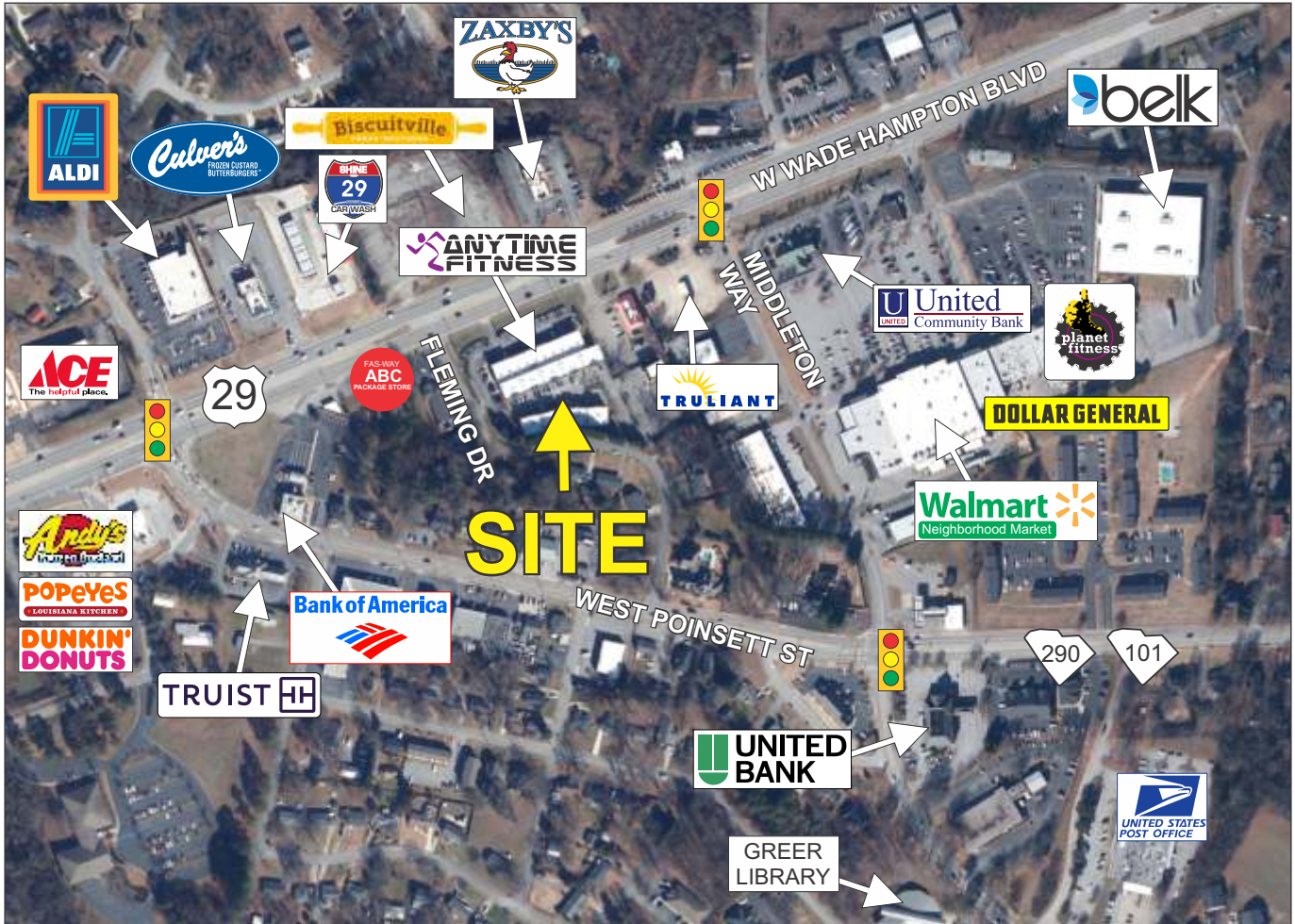
ACCESS FROM WADE HAMPTON BLVD. (HWY 29) OR FLEMING DRIVE