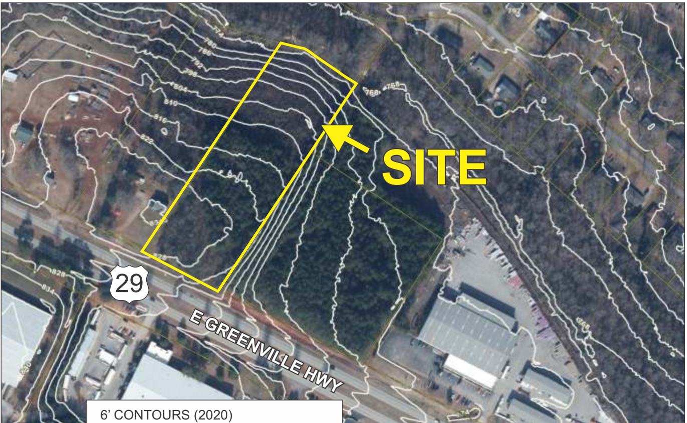
6' CONTOURS (2020) FROM SPARTANBURG COUNTY GIS